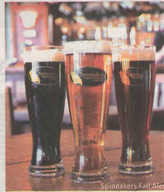
Spinnakers Fall Ales