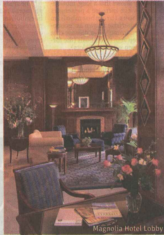
Magnolia Hotel Lobby