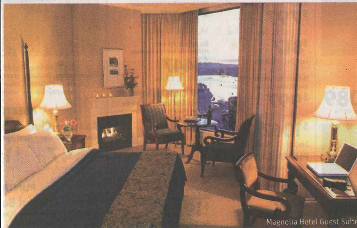
Magnolia Hotel Guest Suite

One of our favourite spots for seasonal, and the occasional themed noshing (the Titanic promotion was fabulous with brews like the Unsinkable Molly Brown), is just across the inner harbour of Victoria at Spinnakers Gastro Brewpub. Sitting by the large windows, gazing out over the water, the service and the food are hard to beat, but the beers are quite simply...outstanding. Celebrating the warmth of the fall season is the return of Vanilla Spiced Pumpkin Porter. This dark, full bodied nectar is accented with plenty of spice and vanilla pods – intriguing to note that each batch is made with 20-30 locally grown, roasted pumpkins. "We completely sold out of every drop we produced last year – it's really become a seasonal favourite," says publican, Paul Hadfield. "It's a delicious dessert beer – it's like having a pumpkin pie in a glass." The bakery is mixing up specials too with pumpkin spice bread (truly, one can never have enough pumpkin!), and chocolatier Crystal Duck utilizes the varied flavours in the beer to "push her limits" creating special spiced chocolates inspired by the traditional tastes of fall. Each of these treats is in limited release and best of all...they are only available at Spinnakers. Enjoy!